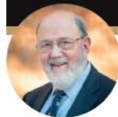
Professor N.T. Wright