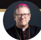
Bishop Robert Barron